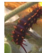
Pipevine Swallowtail Caterpillar (Pipevine leaves are its Host plant)

2. Remove Invasive Plants: Invasive plants can out-compete native plants and escape our yards causing major damage to our public lands. Such as Vinca Major , Pampas Grass , and Chinese Tallow .