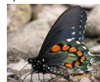
Pipevine Swallowtail Battus philenor

5. Build habitat: Providing water, shelter, and food sources for wildlife can make an important difference! A Smart Garden even lets leaves do the fertilizing, feeding everything from birds to micro-organisms... and saves you time!