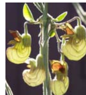
Dutchman's Pipe Aristolochia californica

1. Planting Smart Plants: The foundation of a Smart Gardening landscape is planting local native plants – to restore natural balance. A seasonal succession of native plant flowers, berries and fruit is best for our native birds, bees, butterflies, and other beneficial insects.