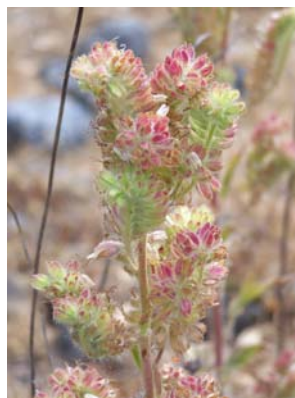
Pine Bee Flower (in summer)